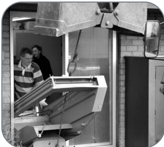
The disposal of the old X-ray system

And, with a wink, he mentions another advantage compared to analog X-ray imaging: " I don't ever have to clean the developing equipment any more or try to remove a film that got jammed in the works."