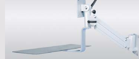
(Item no.: Wand-HV)

Optional: Height adjustable wall bracket incl. keyboard shelf