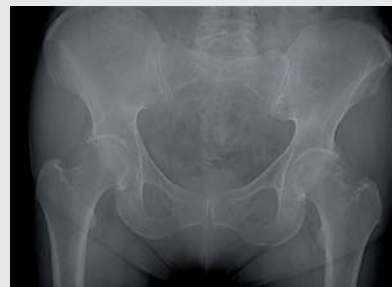
Exposure without DX-R image processing