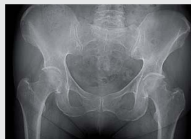
Exposure with DX-R image processing